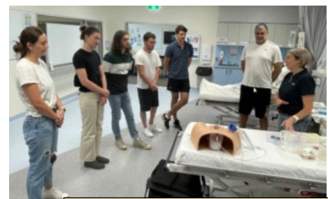
Year 3 medicine students at one of our rural locations attending orientation.

Rural residents of South Australia, Aboriginal and/or Torres Strait Islander applicants and applicants from interstate with rural backgrounds are encouraged to apply.