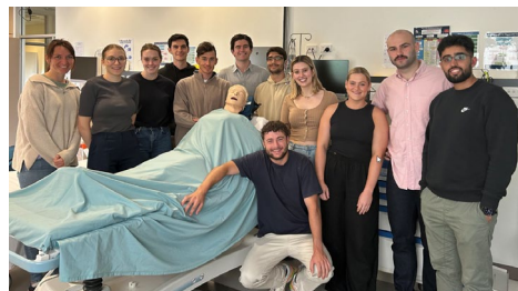
Year 3 medicine students at Mt Gambier campus attending orientation.