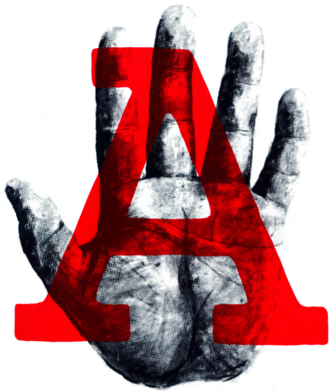
Anthropogenic Relating to, or resulting from the influence of humans.