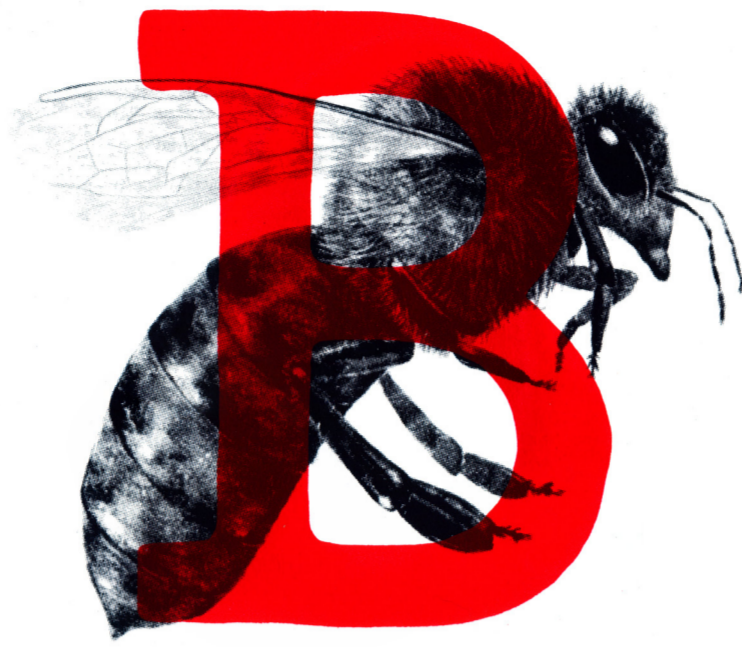
Bee pollinators of plants including food crops. Environmental changes due to climate change have a direct impact on bee development.