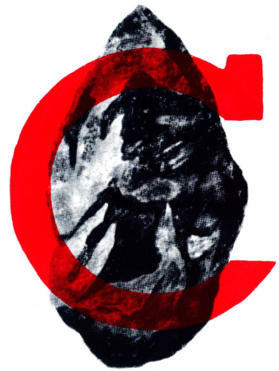
Coal The burning of coal is one of the largest contributors to anthropogenic climate change