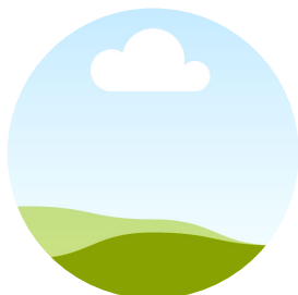
TBC - RECRUITING COLLEGE SUPPORT OFFICER

gemma.flett@flinders.edu.au 08 7421 9225